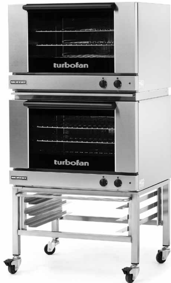
Model E27M3/2C shown